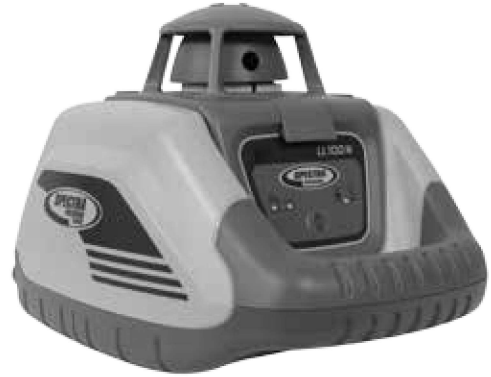
LL100N features a removable rotor cage for full 360° coverage