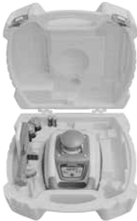
Complete system carrying case includes tripod and your choice of grade rod.