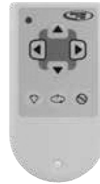
Optional RC601 Remote Control aids in slope matching