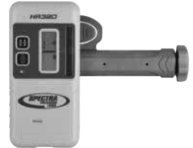
HR320 Receiver and C59 rod clamp included with every package