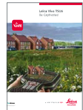
Leica Viva TS16